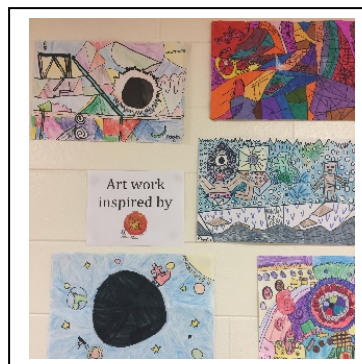
Student work inspired by 'Dot Day.'