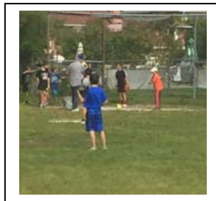
Boys and Girls 3 Pitch practices continue in preparation for the Area Finals next week.